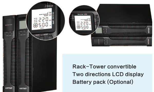
Rack-Tower convertible Two directions LCD display Battery pack (Optional)